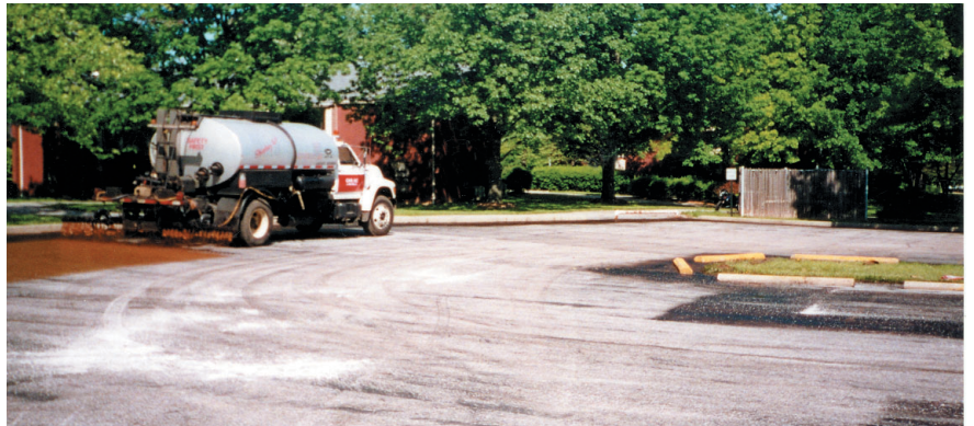
After sweeping the street, Interior Emulsions Ltd. spray applies CRF Restorative Seal. In less than an hour fine aggregate is applied, then drag-broomed to fill cracks and voids.